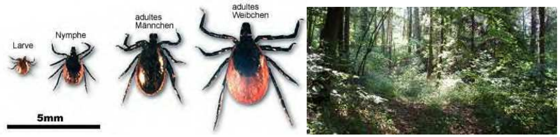
(lifecycle of the tick)

A female tick lays its eggs and the larvae hatch. After feeding on blood, the larvae develop over the course of several weeks into so-called nymphs and then into adult ticks. Ticks are dependent upon sucking blood in all three phases of their lifecycle. After each meal of blood, they leave their host. The larvae are less than half a millimeter in size, and thus barely visible to the naked eye.